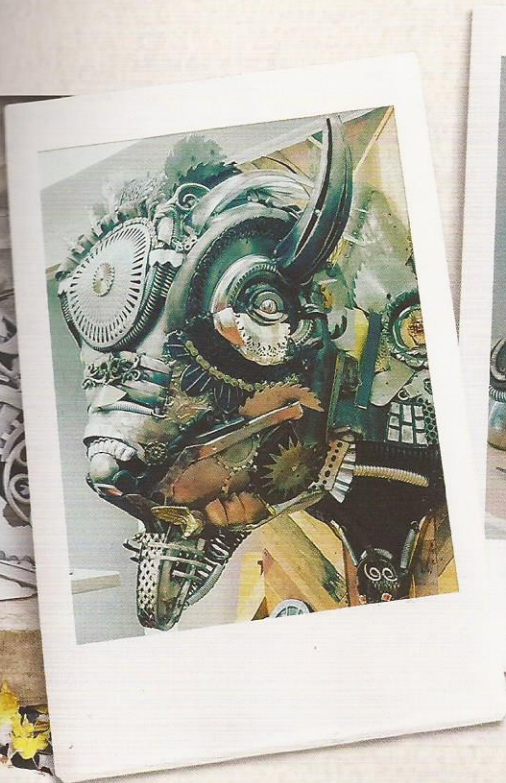
Seven Bird Bison has a secret: concealed around the magnificent head of the buffalo are seven delicate birds